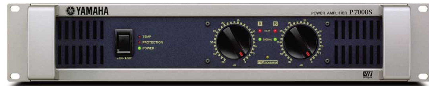
P7000S Front Panel